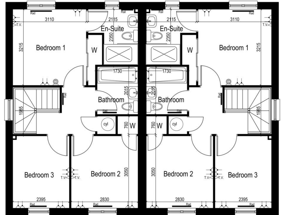
First Floor Plan 44.5sqm